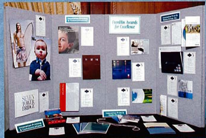
Some of the Franklin Award Winners