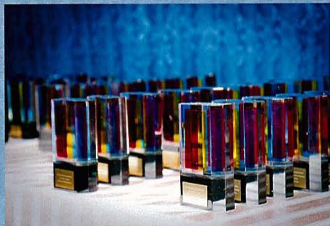
And the Winner is...