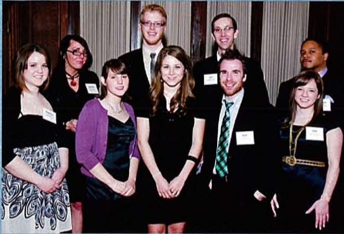
Students from Robert Morris University, Moon Township, PA