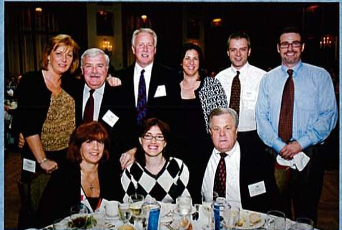
Riegel Printing Company, Inc.