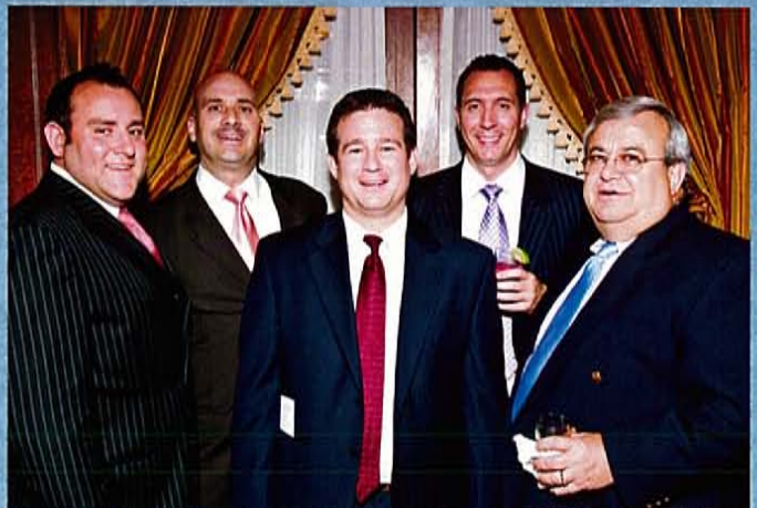
Canon Business Solutions having a great time!