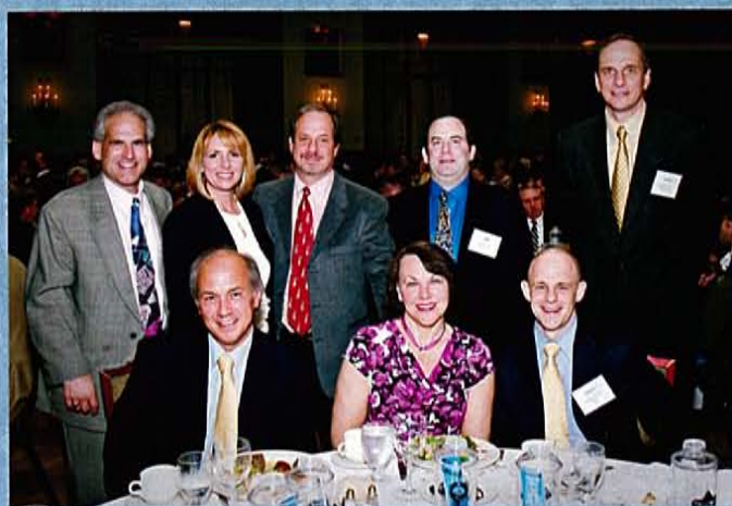
Committee members, judges, guests, emcee sharing a table. Good Job Everyone!