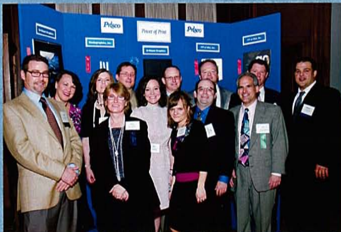
2009 Neographics® Committee