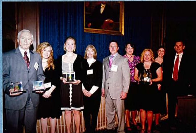
Power of Print Winners, Sponsored by Prisco