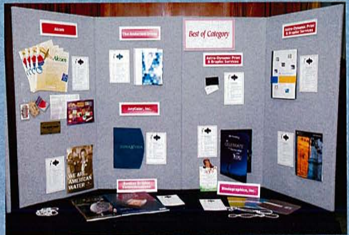
Some of the Best of Category Winners