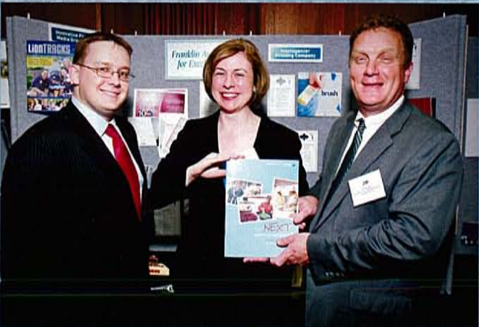
Proud Neo Winners