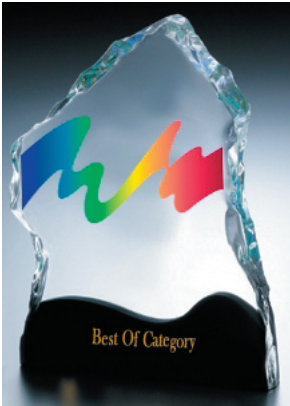
Best of Category Trophy